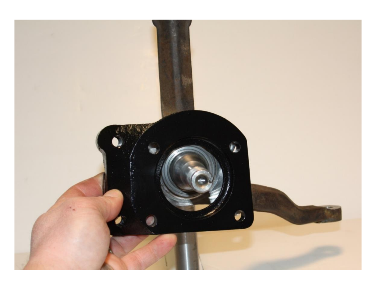
←Front Of Car

Applications: 71-73 Mustang, 70 Falcon, 71-73 Comet, 71-73 Cyclone, 71-73 Cougar, 71-73 Torino, 71-73 Montego