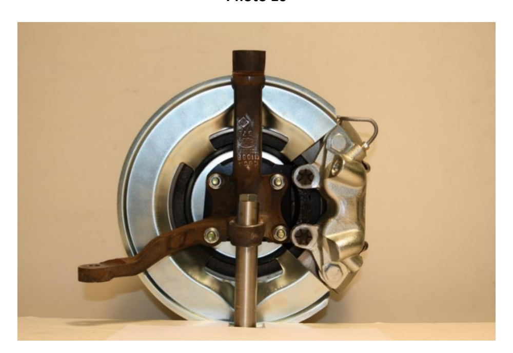
Front Of Car→